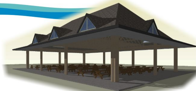
Artist's rendering of the Outdoor Recreation Pavilion.

It's all about accessibility and having fun for our Marydale Park visitors. The facility's universally designed, multi-purpose recreational pavilion will feature space for hard surfaced sports, such as basketball, ball hockey and volleyball. The 83.7 x 51.6 metre pavilion will also be made available and used by all members of the community for their recreational and social activities. The 4,310 square foot pavilion will be covered with open sides providing protection from the sun's hot mid-day rays, while allowing the refreshing breeze off the lake to keep visitors cool.