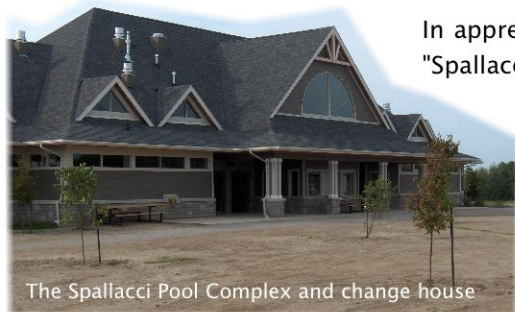
The Spallacci Pool Complex and change house

In appreciation of the Spallacci family's support, the accessible pool building will be named the "Spallacci Pool Complex".